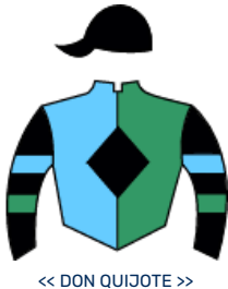
<< DON QUIJOTE >>

3 G1 PAILITA DE HUEVO 3 0 1 4 8 16 3 0 1 4 8 16 0 0 1 1 0 2 $7.795.750