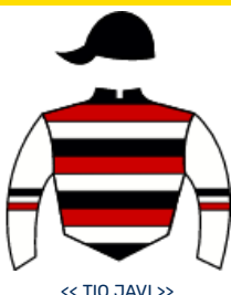
<< TIO JAVI >>