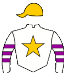
<< EL CHUNCHO >>

2 G1 BONITA SORPRESA 2 2 0 1 8 13 2 2 0 1 8 13 0 0 0 0 1 1 $4.031.400