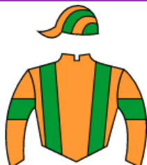
<< VASQUEZ RETAMALES >>