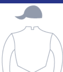
<< VITORIO >>

3 G1 GOOGY 1 0 3 1 7 12 1 0 0 0 2 3 0 0 0 0 0 0 $3.130.000