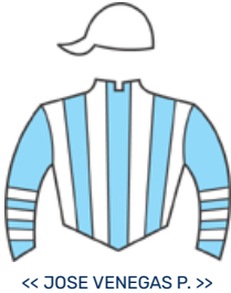
<< JOSE VENEGAS P. >>

1 G1 SOGNA CON ME 2 7 6 8 16 39 2 7 6 7 14 36 0 0 1 2 2 5 $12.008.500