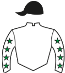
<< ARTURO Y CECILIA >>