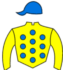
<< PINKY >>