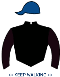
<< KEEP WALKING >>

2 G1 SINNERMAN 1 2 4 2 8 17 1 2 4 2 8 17 0 0 0 0 1 1 $6.568.800