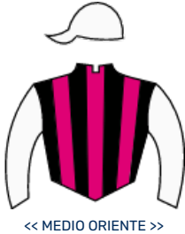
<< MEDIO ORIENTE >>