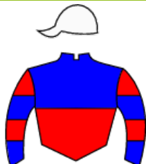
<< ESTOS NO FALLAN >>