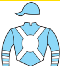
<< MAMEZA >>