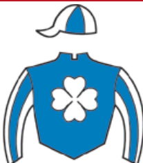
<< CHARITO >>

1 G1 CAMELOT 4 2 3 3 28 40 0 0 0 0 4 4 0 0 0 0 1 1 $5.123.000