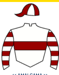
<< AMALGAMA >>

4 G1 WONDERFUL STAR 3 5 4 2 26 40 1 1 1 0 10 13 0 0 1 0 3 4 $6.732.100