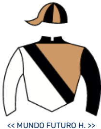
<< MUNDO FUTURO H. >>