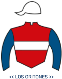
<< LOS GRITONES >>