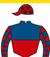
<< CAMILO OSSES >>

4 G1 INDIA MAULINA 2 3 4 2 19 30 2 3 3 2 18 28 0 0 0 0 2 2 $6.495.200