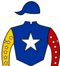
<< CHAMO CANDELA >>

NALALA 4 3 8 4 18 37 0 0 3 1 2 6 0 1 0 1 2 4 $14.920.900