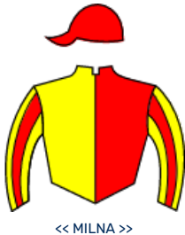
<< MILNA >>

(M.C.) 4 55,0 2 R.Avila (4) 9 G. Covarrubias E. Patternrecognition y Sudan Beach por Sudan (Ire) ( Haras Santa Olga )