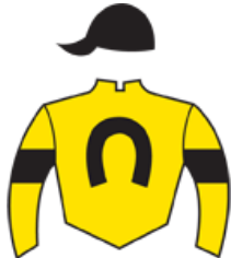
<< QUARTER DOLLAR >>