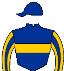
<< BRUCE >>

SEA OF GOLD 6 13 2 3 59 83 6 13 2 3 57 81 0 2 0 1 6 9 $29.120.200