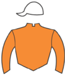
<< GALIANO >>